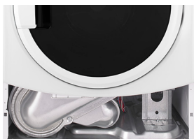
FRONT ACCESS PANEL