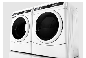
MATCHING WASHER AVAILABLE