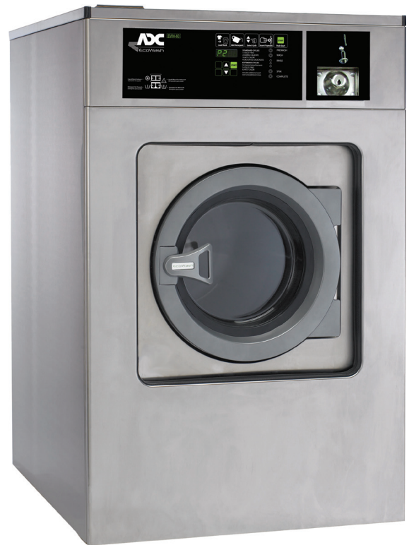
EWH-60 Coin Washer/Extractor