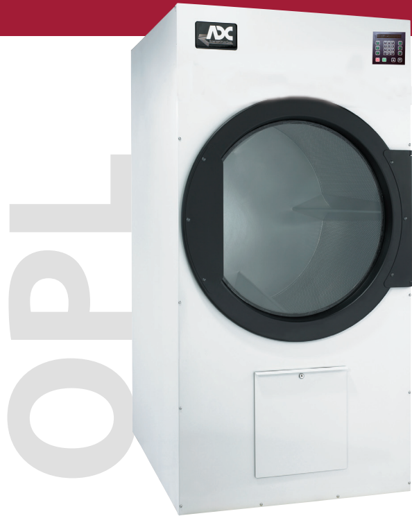
AD-758V OPL Dryer