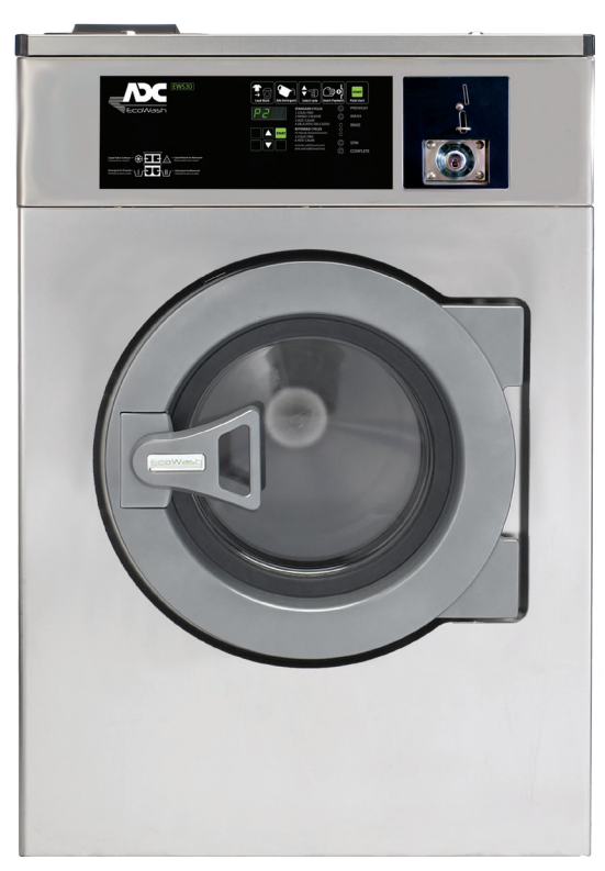
EWS-30 COIN Washer/Extractor